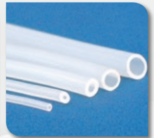
Siloflow PPI Silicone Tubing